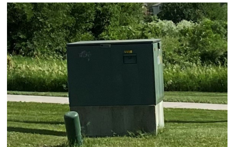
Photos of underground construction