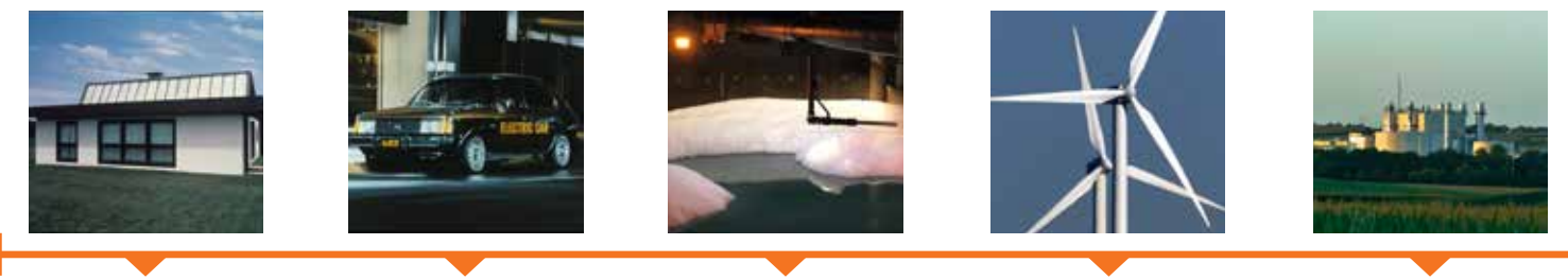
1976 LES built a solar home.