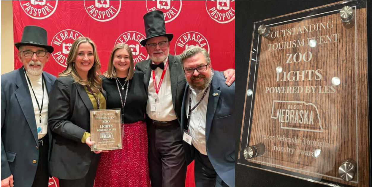
Nebraska Outstanding Tourism Event

Visit Lincoln · Follow January 14 · 🌐 Big news, Lincoln! 🎉 The Lincoln Journal Star shared that the Lincoln Children's Zoo annual Zoo Lights, powered by Lincoln Electric System (LES) , has been crowned the best in Nebraska! 🏆🌟 But wait, there's more—it's also shining bright as one of the most popular holiday light displays in the entire U.S.! 🤩 This festive honor comes courtesy of Mixbook, a photobook company that surveyed 3,000 families.